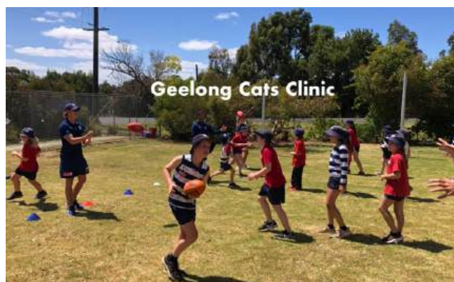
Geelong Cats Clinic