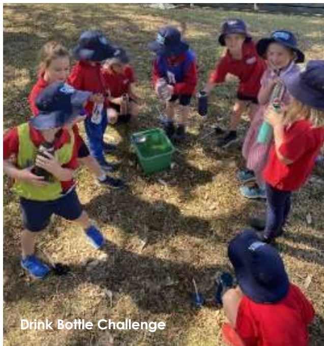
Drink Bottle Challenge